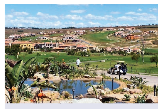
RIGA Heights Location: East legon hills Area land size: