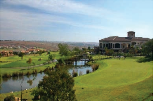
MINSK Gardens Location: Oyarifa Area land size: